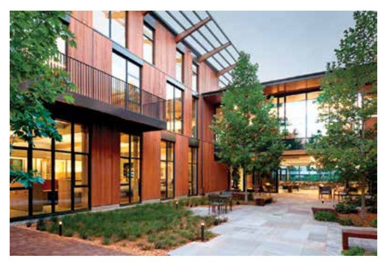
David and Lucile Packard Foundation; Los Altos, California; Architect: EHDD; Completed: 2012; WoodWorks Award Winner: Green Building with Wood.

There are many remarkable examples of wood buildings that have been designed to blend with their environment, and give occupants a deep connection to nature inside and out.