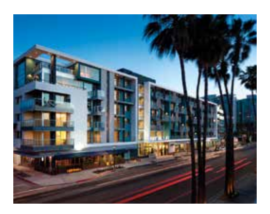
According to the U.S. EPA Greenhouse Gas Equivalencies Calculator, estimated carbon benefits for the four- and five-story Stella equate to 2,683 cars off the road for a year or the energy to operate an average home for 1,194 years.

With proper attention to detail and the application of building science in design, wood buildings can meet or exceed the requirements of new energy codes and standards, as well as