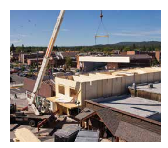
Speed record: Taking speed of construction to an entirely new level, the two-story Long Hall in Whitefish, Montana, designed by Datum Design Drafting and engineered by CLT Solutions, took just five days to erect and gave the owner a sustainable, energy-efficient building. It was the first commercial building in the U.S. made from CLT.

For example, glulam can be manufactured to achieve spans as long as 100 feet and walls up to 20 feet. (See the case study on the Bullitt Center in Seattle, Washington.)