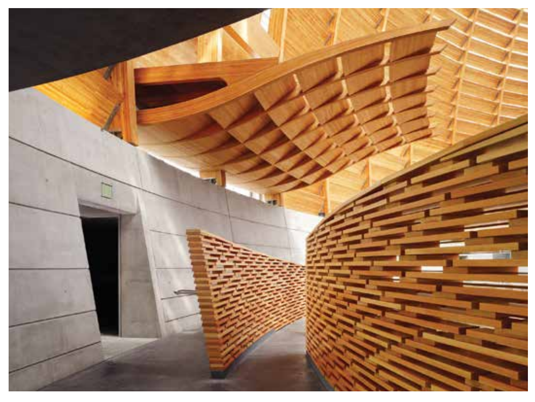
Cathedral of Christ the Light; Oakland, California; Design architect: Skidmore, Owings & Merrill.

Designers today are finding new possibilities in one of the oldest building materials on earth. Wood has always been valued for its beauty, abundance and practicality, but many of wood's inherent characteristics are rising to very current challenges. Wood's traditional values and newest technologies meet in the projects presented in this course, illustrating the advantages of wood in four areas: cost-effectiveness in a wide range of projects; adaptability for use in challenging, visionary new designs; lower environmental costs throughout its life cycle, from its source in renewable, carefully managed forests, through an energy-efficient service life, and often on to a new, recycled and