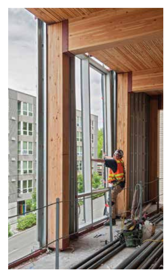
The Bullitt Center. (See case study.)

For example, glulam can be manufactured to achieve spans as long as 100 feet and walls up to 20 feet. (See the case study on the Bullitt Center in Seattle, Washington.)