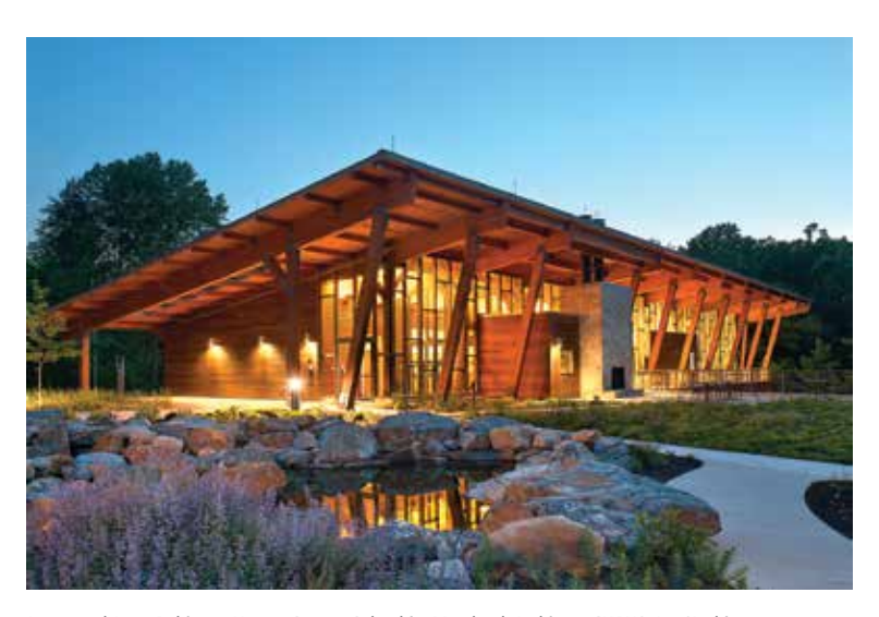
James and Anne Robinson Nature Center; Columbia, Maryland; Architect: GWWO, Inc./Architects; Completed: 2011; WoodWorks Award Winner: Institutional Wood Design.

Wood was used extensively in this 49,000-square-foot LEED Platinum, net zero energy company headquarters, emphasizing the building as a healthy and sustainable place to work. By combining exposed wood inside with views to the outdoor courtyard, the architect created a relaxed environment where the occupant is in constant contact with nature.