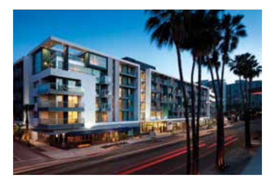
Stella; Marina del Rey, California; Architect: DesignArc; Completed: 2013.

Adding to the savings, the framer says panelization typically takes 10 to 15 percent off the timeline compared to traditional site-built construction. If there