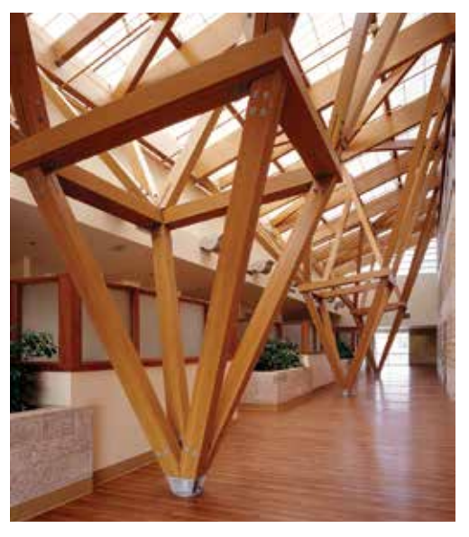
Thunder Bay Regional Health Sciences Center in Ontario, designed by Salter Farrow Pilon. Architects Inc., was the first hospital in Canada to gain approval for the use of wood as a primary structural element.

to intuitively. This positive connection is being documented by a growing body of research, and can be a valuable asset in spaces filled with electronic devices and screens, synthetic materials and artificial lighting.