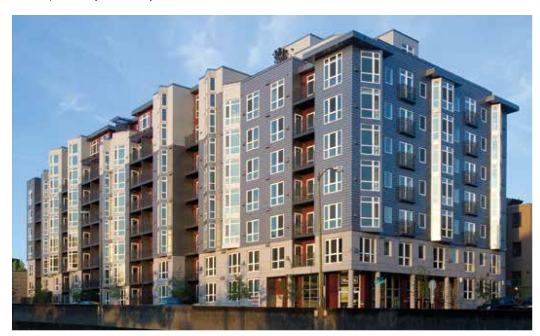
Environmental recognition with local green building programs was a plus for the Marselle Condominiums in Seattle, Washington, designed by PB Architects, but cost was the driving factor in the decision to use wood construction.

In addition to CLT, parallel strand lumber (PSL), glulam and prefabricated paneling systems are among the products contributing to a wider range of wood buildings. They have made wood a viable choice for applications such as arenas, gymnasiums and lobbies, which require tall walls and large open spaces with minimal, intermediate supports.