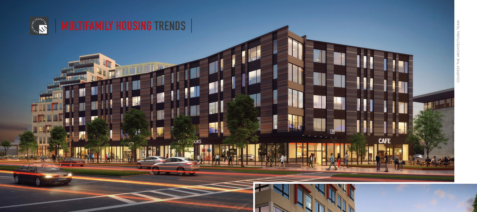
The transit-oriented Nubian Square development in Roxbury, Mass., designed by The Architectural Team, is injecting vitality into the former leading commercial center known as "the heart of Black culture in Boston."

Other building teams are showing how 100% affordable communities can also bring mixed-use economic benefits-often with neighborhood-focused businesses, startups, and even nonprofit job generators. In the Bronx, N.Y., for example, The Peninsula replaces a hillside juvenile detention center with a five-building, five-acre mixed-use campus where the second of three phases is now in construction. The first two buildings completed include 183 of 740 total affordable units as well as a memorable light-industrial structure merging a food incubator with six small-scale food makers, refrigerated storage, and shelf capacity for surplus edibles. A rarity in the multifamily sector, an aerobic biodigester processes food waste into fertilizer for local use, including on the property's green public spaces.