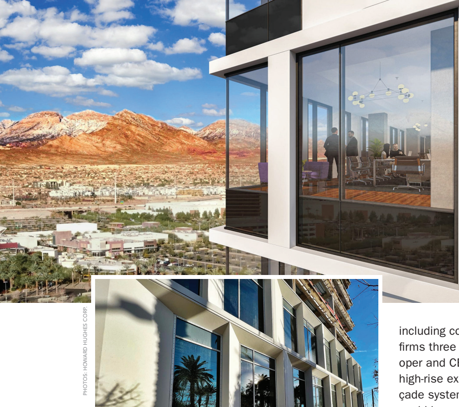
An innovative, light-colored cladding of preglazed, preinsulated GFRC panels clads 1700 Pavilion in Summerlin, Nev., accelerating construction for the lifestyle-driven commercial building.

related to a particular project. Suffolk Construction has successfully warehoused materials recently to keep projects on schedule, while other contractors are reporting related shortages of storage facilities, leading the teams to erect temporary laydown facilities. Taking a proactive posture has helped contractor XL Construction, which self-performs some of its work, to deal with reported lead times of up to a year for curtain wall systems and precast wall cladding.