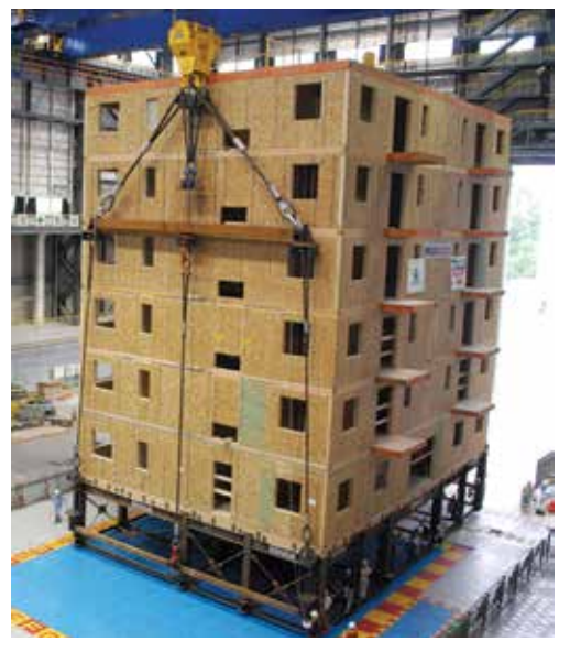
Subjected to three earthquakes on the world's largest shake table in Miki, Japan, this full-scale wood-frame apartment building performed excellently with little damage.

Structural wind-loading requirements are specified in Chapter 16 of the IBC and obtained