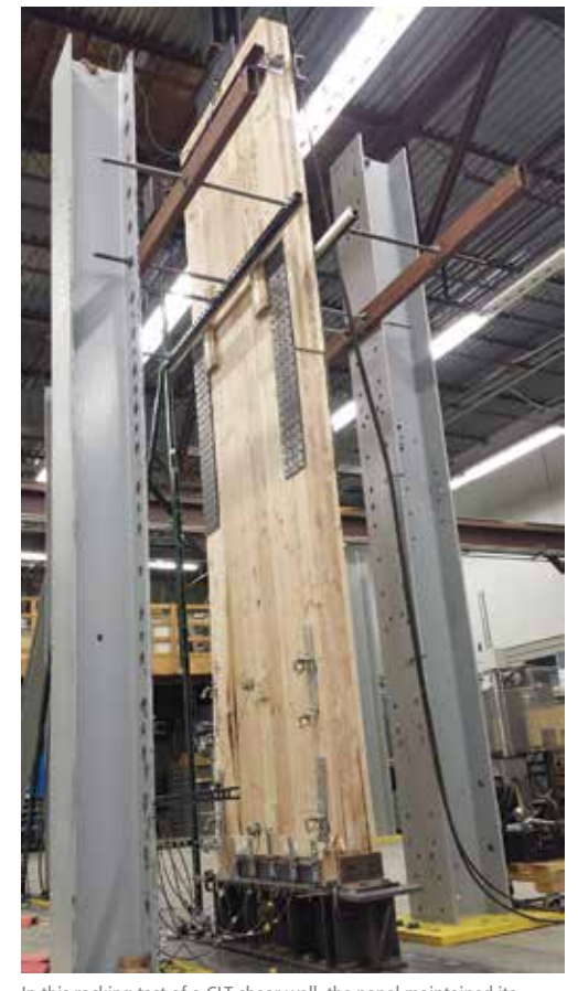
In this rocking test of a CLT shear wall, the panel maintained its lateral load-bearing strength under cycling loading to simulate seismic conditions and returned to a vertical position at completion of the test.

Highlighting wood's recognized performance as a structural material, FEMA P-320: Taking Shelter from the Storm: Building a Safe Room for Your Home or Small Business, includes information and design drawings for building wood-frame safe rooms.